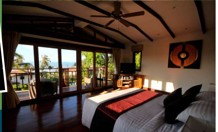
The Village Coconut Island