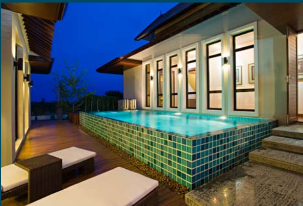
Sivana Hills Luxury Pool Villas

Sivana Hills Luxury Pool Villas in Hua Hin won the silver award in the Best Development Thailand category. Sivana Hills, by Bangkok Living Development, is the second development by the Thai company. With interiors and exteriors designed by some of the top firms in Thailand, the award comes as an exclusive edge to the project and proves the success of the overall concept.